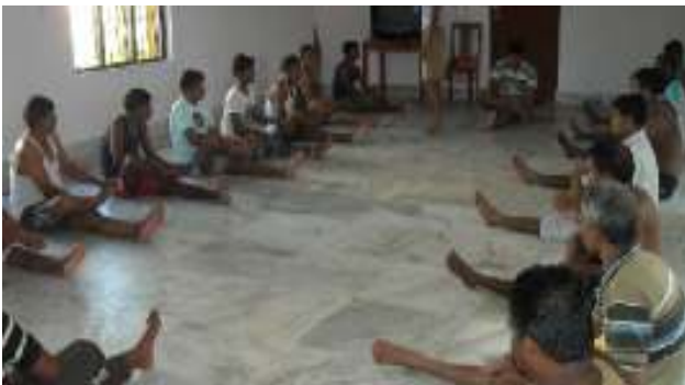
Yoga Session at Reborn

Freedom has different meanings for different people. For the hundreds of young men who are let down by the addiction to drugs and alcohol, freedom can't but mean release from the bondage to addiction and resuming the disrupted journey of life anew, with a motto for cleanness and sobriety for the rest of life. Believe it or not, giving up the bondage to narcotics on the part of an individual is as challenging in its intensity as throwing up an alien Raj on the part of a nation. As if to celebrate that unique spirit of freedom, the self-inspired group of addicts-turned-clean launched their dream venture Reborn on 15 th August last, the 63 rd day of India's freedom. Sans ceremonial hullabaloo, sans speeches by leaders, and sans media glare, it was launched amidst an informal, evening get-together of friends and supporters drawn from diverse walks of life from twin city of Cuttack-Bhubaneswar, such as lawyers, doctors, social workers, technocrats, women activists, housewives and above all several ex-addicts belonging to Narcotic Anonymous fraternity.