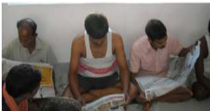
Inmates reading Newspapers at Reborn

including family members. The second stage is a continuation of the first stage except some relaxation allowed in respect of contact with outsiders through phone and face-to-face. In this stage, he shall be escorted to NA/AA (Narcotic Anonymous/ Alcoholic Anonymous) Meetings by the concerned staff. The third, pen-ultimate stage focuses on relapse prevention and creation of positive motivation in the inmate for ultimate return to the social world, and therefore organizes guided social exposures for him, such as visit to home for one or two days. However, the inmate is required to maintain a constant therapeutic relationship with the staffs and co-inmates of the Centre. The fourth or final stage makes him ready to leave Reborn and helps him contemplate positive plans for himself and his near and dear ones. Gradually he gets accustomed to the routine of his daily life, be it about his family, educational institution or workplace. His plan to live a dutiful life without being a burden on anybody and rather to prove useful for everybody around matures in this Stage. The last Stage is also called the bridge to Long Term Recovery.