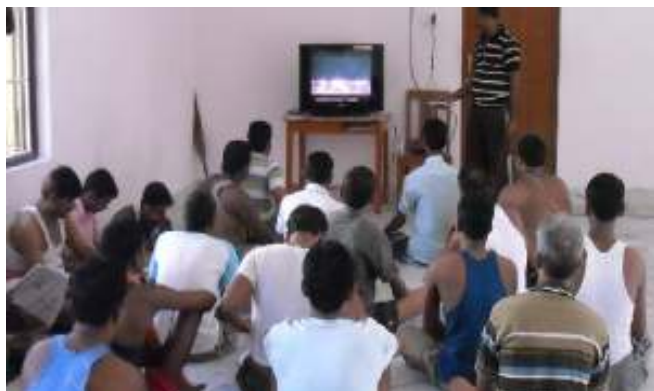
TV time at Reborn

Reborn further assures, “In keeping with our commitment to extend total solution in respect of each case, our doctor consultants and trained staff including the ever vigilant Recovery Brotherhood will answer all of your problems while maintaining impeccable confidentiality. Based upon a rich pool of work experience and professional expertise, our Counselor will offer you a treatment plan that is unique and foolproof. The said treatment plan shall comprise methods and procedures from both mainstream and indigenous therapies including Yoga, Meditation, Bipasana etc”.